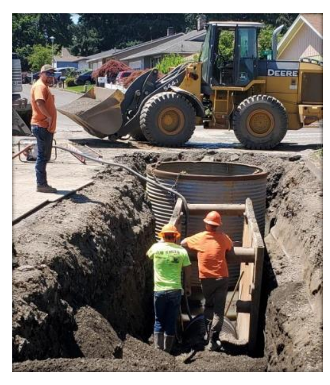
Gladstone Public Works: storm water goals