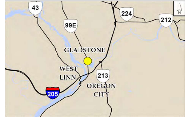
Intersection location on OR 99E just south of the Clackamas River Bridge.