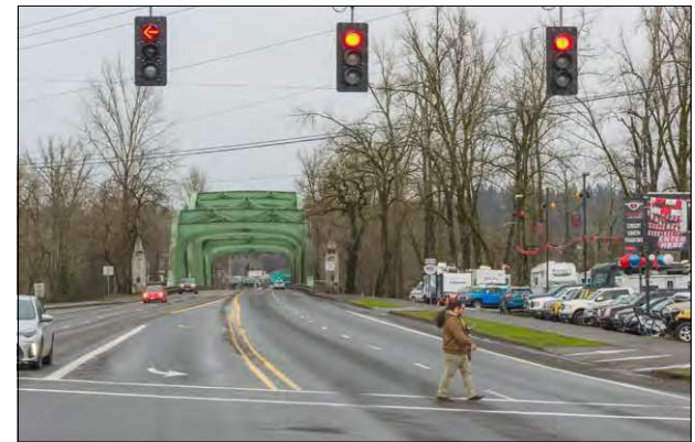
A pedestrian crossing SE McLoughlin Boulevard, a top 10% Safety Priority Index Site.