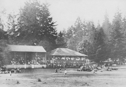
↑ Chautauqua baseball game in Gladstone Park Athletic field. After 1908.