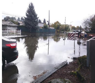
In heavy rain, stormwater mixes with untreated sewage and overflows on city streets (here, on Portland Ave in front of Public Works near GHS).