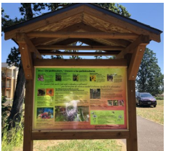
Visit the butterfly hill at Gladstone Nature Park located at 18111 Webster Rd in Gladstone.