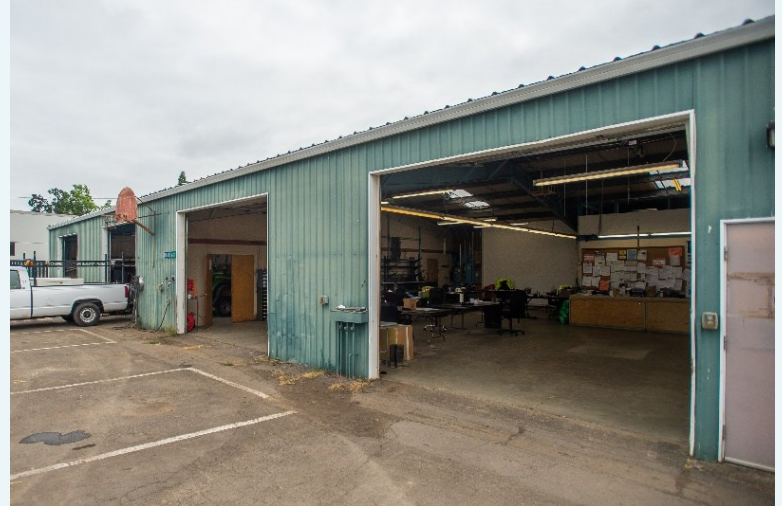
↑ Gladstone City Council is seeking voter approval to replace the 50-year old Public Works building.

The borrowed money would be repaid over the years from existing funds. No additional property taxes would be used for the project.