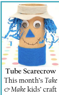
Tube Scarecrow This month's Take & Make kids' craft

Kid Craft: Take & Make Craft Kits - Tube Scarecrow — Sunday, Nov. 13, 2022 (and while supplies last!) Take-home craft kits for kids appear on the 2 nd Sunday of each month and are available to pick up at the Gladstone Public Library while supplies last. Most supplies and instructions are included. This month's Tube Scarecrow kit rolls in on Nov. 13 th - ask for yours at the desk!