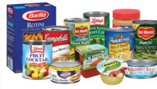
SERVING FAMILIES FROM GLADSTONE SCHOOLS & RESIDENTS OF GLADSTONE, JENNINGS LODGE, AND OAK GROVE

The pantry is open to shoppers every Thursday from 3 to 5:30 p.m. at 6460 Glen Echo, behind Hillside Fellowship. Parking is available. Please bring bags to carry your groceries.