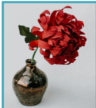
Crepe Paper Chrysanthemum This month's adult craft class (Vase Not Included)