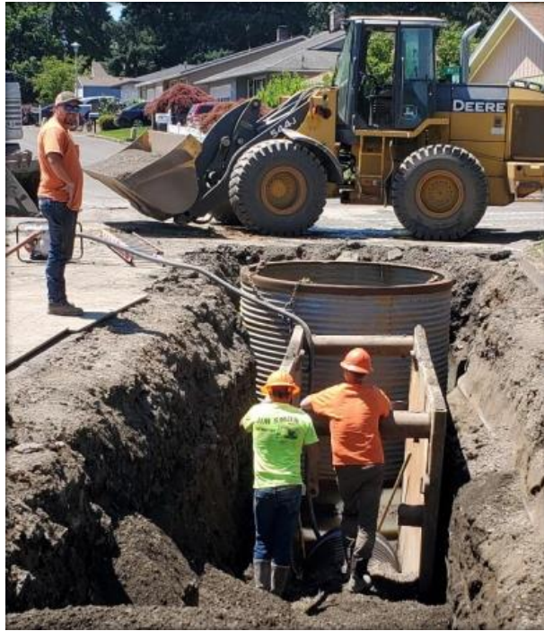
Gladstone Public Works: storm water goals