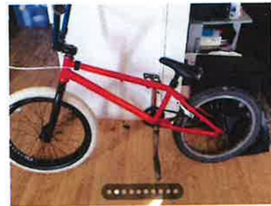
Odyssey BMX Bicycle $300 $400 Gladstone, OR

February 17: Officers responded to a theft of a bicycle that the victim said he saw for sale on Facebook Marketplace. The bicycle had a distinct look and parts custom to the owner. Officers set up a buy sting on the next day, resulting in an arrest of the seller. The seller had a bag containing evidence of money counterfeiting and other crimes. The seller also had felony state wide warrants.