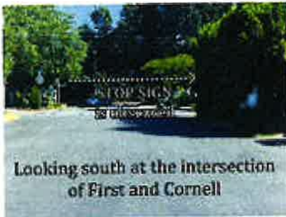
Looking south at the intersection of First and Cornell