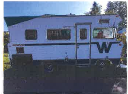
Abandoned vehicle removed by owner