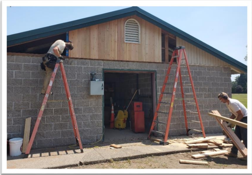
Volunteer group from SDA replaced rotted wood on the upper portion of the bathroom at Meldrum Bar Park.