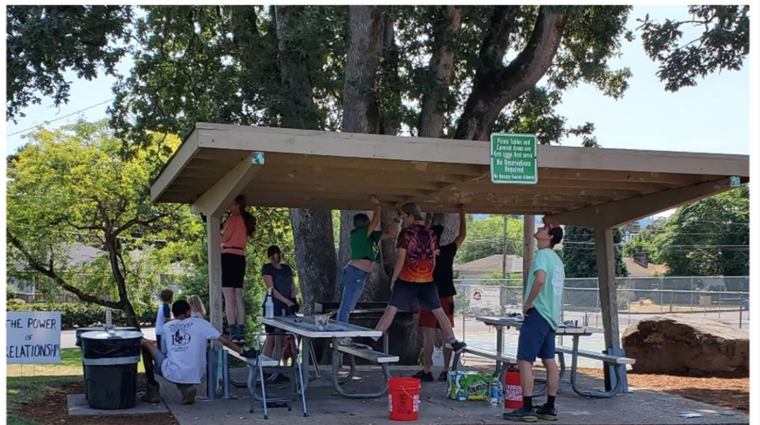
Picnic Structure at Max Patterson got a bit of a face-lift with the help of several volunteers.