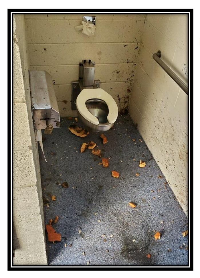
Pumpkin explosion @ park bathrooms