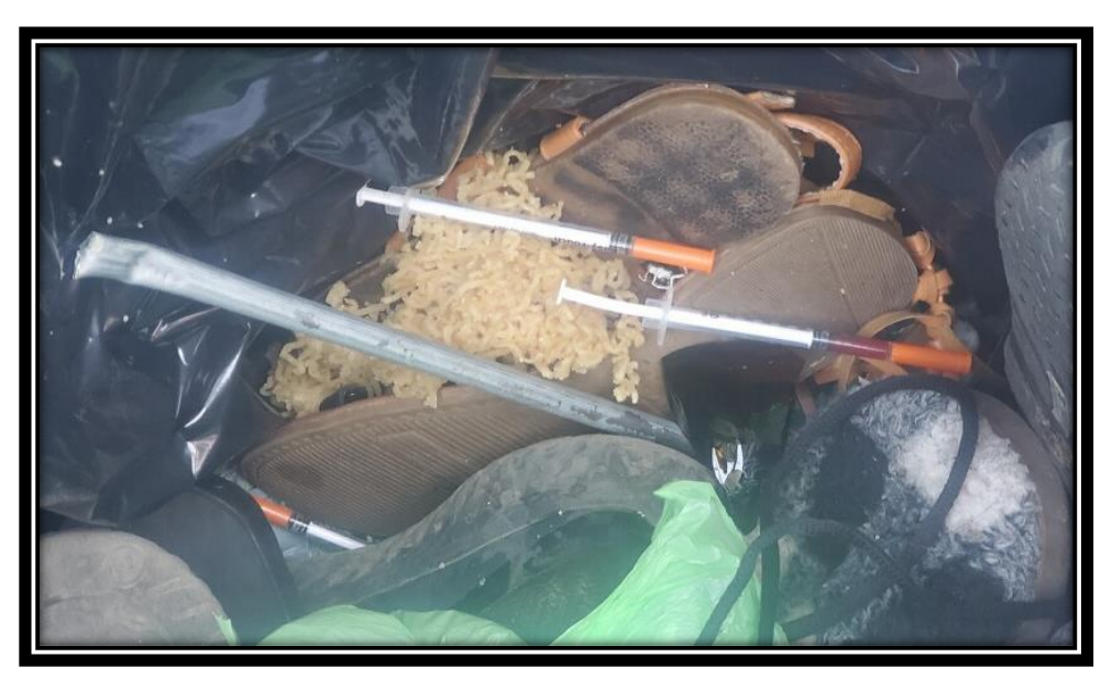
Drug paraphernalia and garbage removed from our park bathrooms