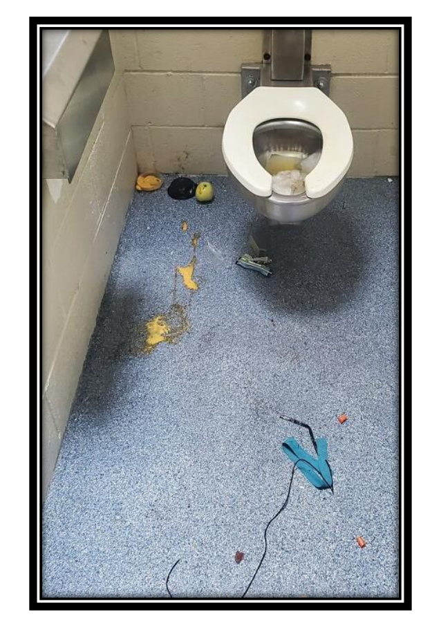
Drug paraphernalia in park bathrooms