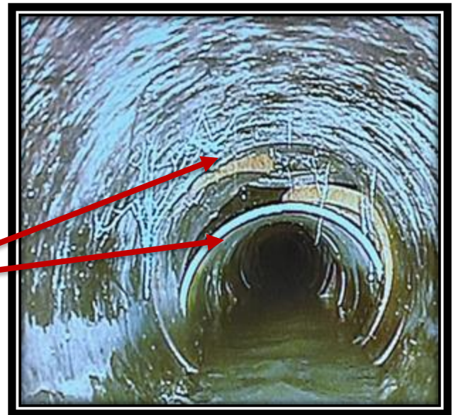
Separated sanitary sewer line on E. Exeter St. (right)