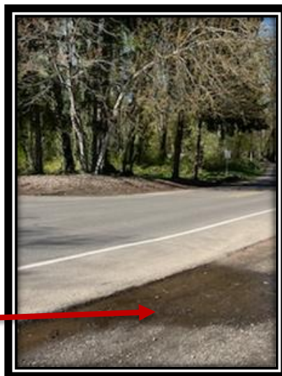
pooling water, sign of a water leak

A Water leak in Meldrum Bar Park near the Community Gardens, which was reported due to the pooling water along the roadway of Dahl Rd. Crews were able to make the repairs in a timely manner.