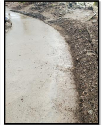
(RC Track walkway – Meldrum Bar Park)