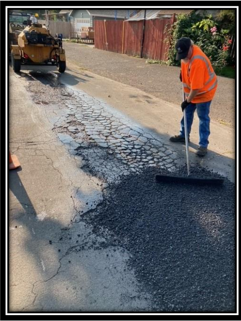
Skin patching (paving) continued, crews laid down 8.25 tons of asphalt on Beatrice Ave.