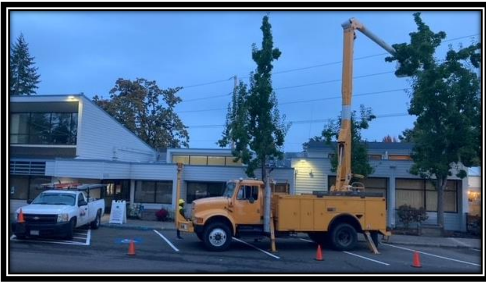
Several trees were trimmed at the Senior Center, the trees needed to be pruned and limbed to prevent future damage to the building.