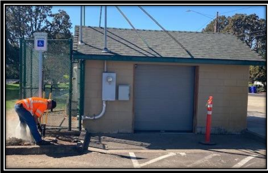
New Handicapped Parking sign was installed at Max Patterson Park near the Spray Park.