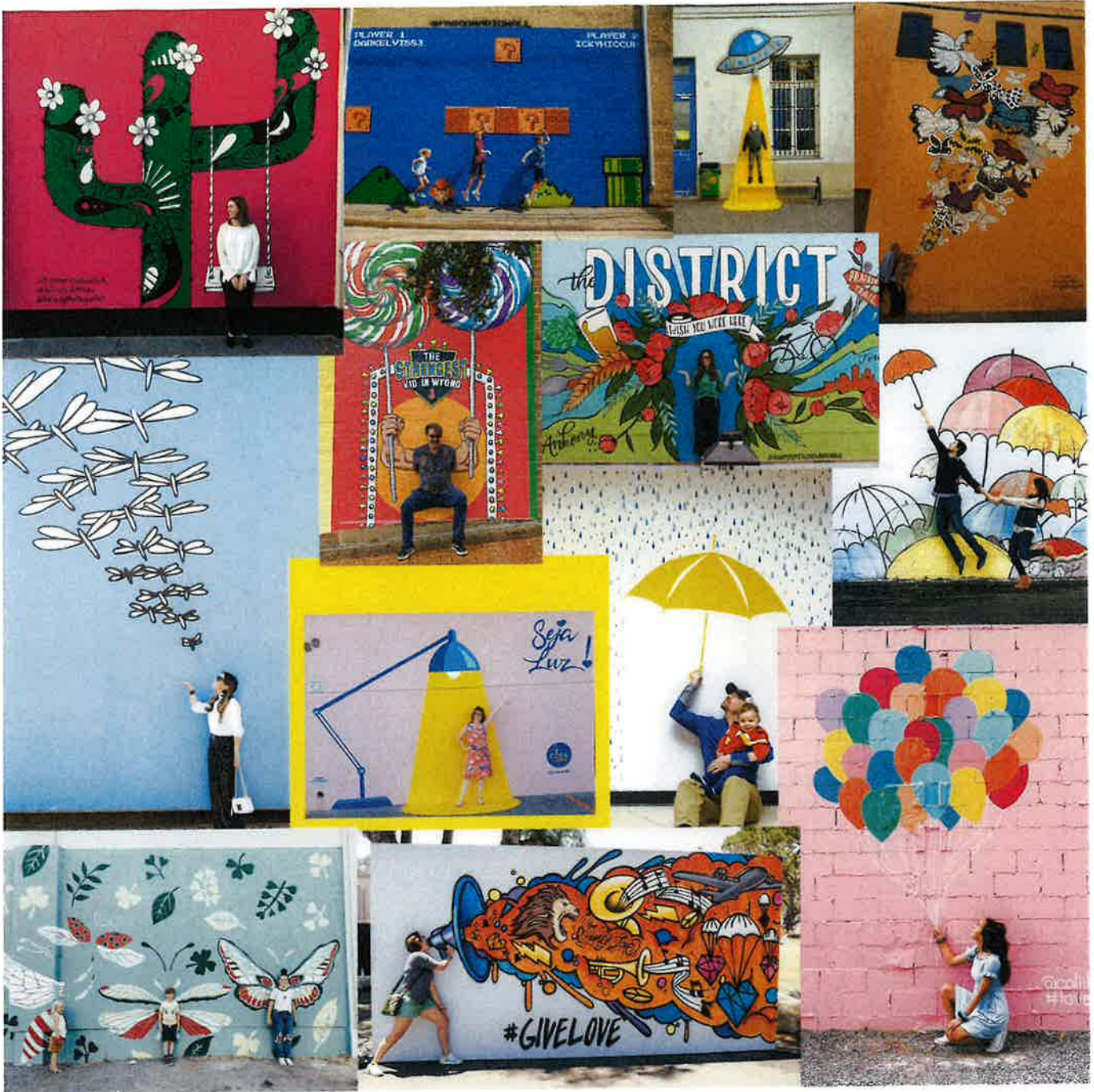
PHOTO OPP ILLUSIONS

Clever visual tricks that invite passersby to interact with the art to create photo-worthy moments